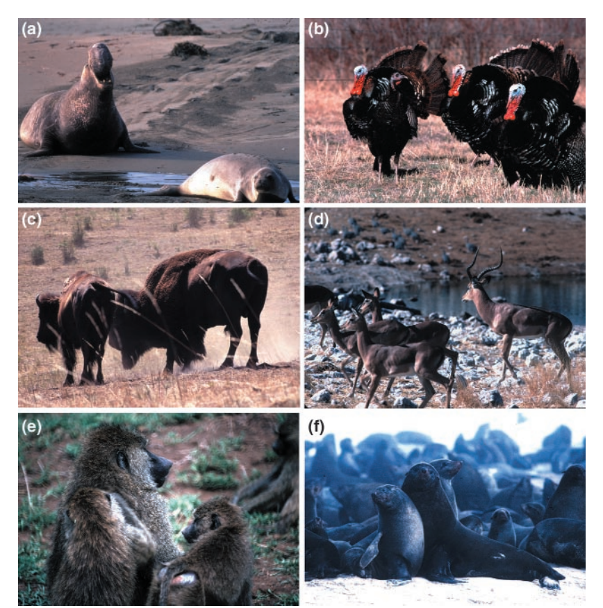
Fig. 1. Sexual-size dimorphism is common among many animal species. (a) northern elephant seals Mirounga angustirostris , (b) wild turkeys Meleagris gallopavo , (c) bison Bison bison , (d) impalas Aespyceros melampus , (e) olive baboons Papio cynocephalus anubis , (f) northern fur seals Callorhinus ursinus . These species show some of the highest sexual dimorphism in size and mass in vertebrates, yet neonate males and females are identical in size in each species. Reproduced, with permission from M. Burcham (a–b), A. Badyaev (c), and A.J. Rapone (d–f).

grown adults has left several unresolved questions. How do we reconcile the striking diversity of ontogenetic processes that produce SSD with highly conserved genetic variation in adult SSD? What accounts for the lack of sex-biased genetic variation in most size traits in adults (i.e. in fully implemented developmental programs): an adaptation to maintain developmental integration in the face of a fluctuating and unpredictable environment or conservatism in gene action? Finally, how does sex bias and sex specificity in developmental processes arise and evolve?