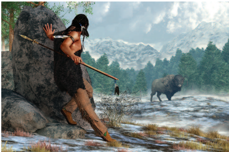
ILLUSTRATION OF HUNTING BISON WITH ATLATL BY DANIEL ESKRIDGE

A s we venture forth this fall, hunting alone or with friends and family, we might take a few minutes to imagine a time when we were as often the prey as the predator. Instead of the smooth bolt of the Remington 700, we worked the rough wood of a spear handle. Instead of a tiny .30-caliber copper-jacketed missile propelled by a burning mixture of the earth's chemicals discovered by 7th-century Chinese alchemists, we used raw muscle to force a hand-sized chunk of flaked stone between giant ribs. Hunting has changed in substantial ways—most importantly that failure no longer means death—but the goals are not so different from thousands of years ago: meat and hides to share, the taking of an animal's life with skill and honor, the fierce freedom of our wild spaces and all that inhabits them. There is an echo, from the Pleistocene, that only a hunter can hear. 🐾